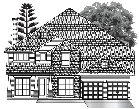
• ELEVATION A3 •