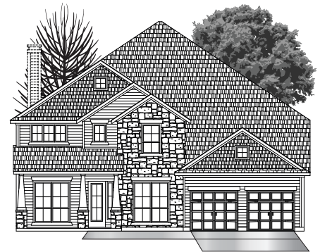
• ELEVATION B3 •