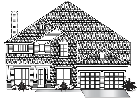
• ELEVATION A3 •