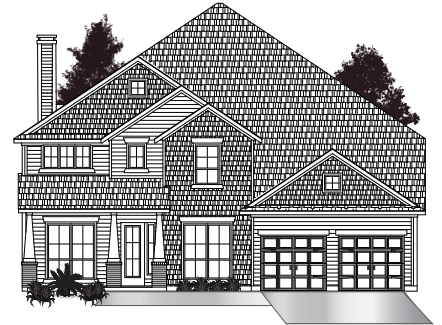
• ELEVATION A3 •