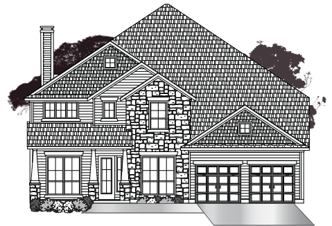
• ELEVATION B3 •