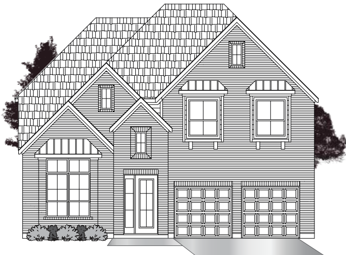
· ELEVATION A2 ·