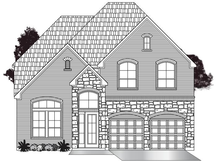
· ELEVATION B1 ·