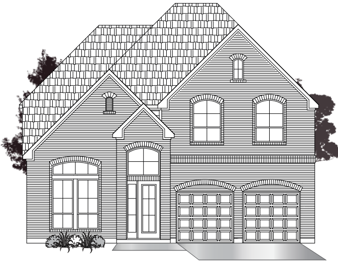
· ELEVATION A1 ·