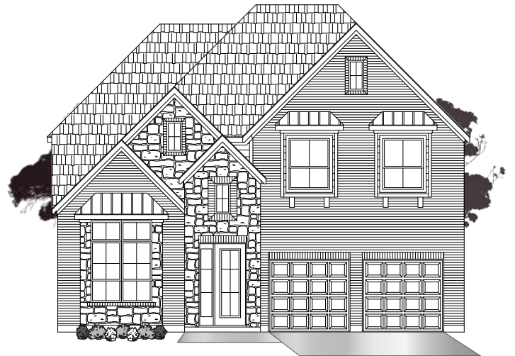
· ELEVATION B2 ·