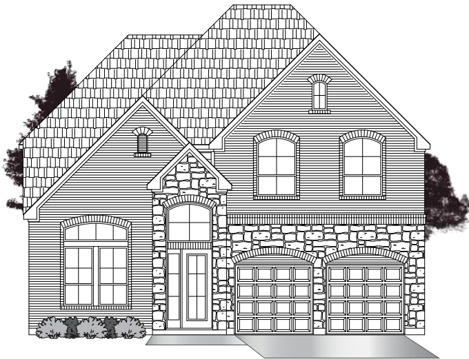
· ELEVATION B1 ·