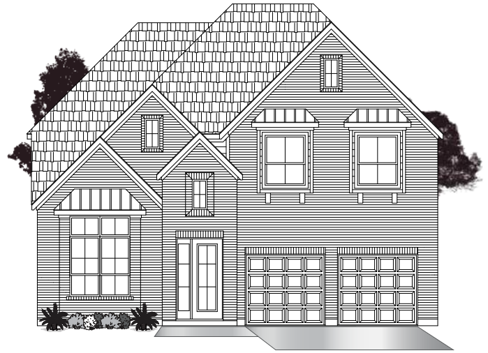
· ELEVATION A2 ·