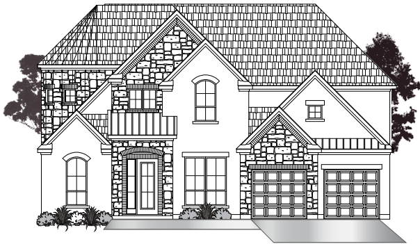
• ELEVATION D1 •