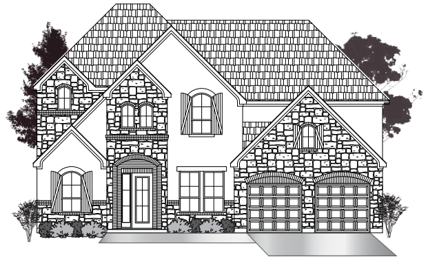
• ELEVATION D2 •