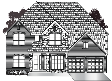
• ELEVATION B3 •