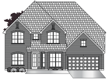
• ELEVATION A3 •