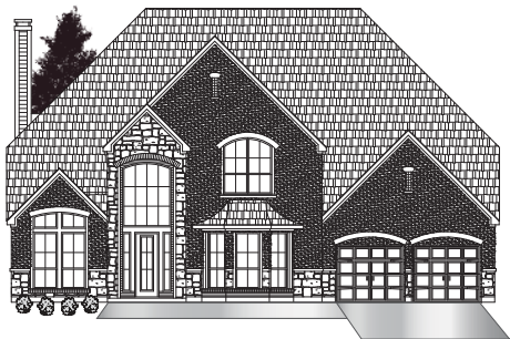
· ELEVATION D1 ·