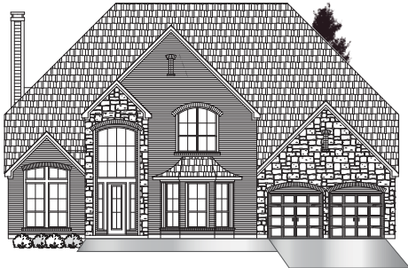
· ELEVATION B1 ·