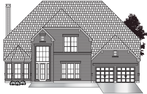
· ELEVATION A2 ·