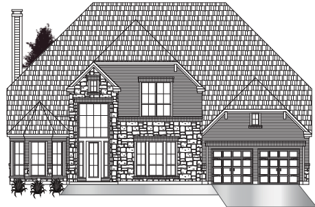
· ELEVATION B2 ·