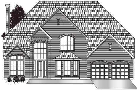
· ELEVATION A1 ·