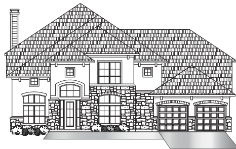
• ELEVATION D3 •