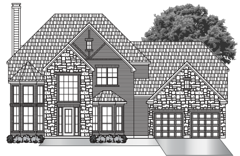
• ELEVATION B3 •