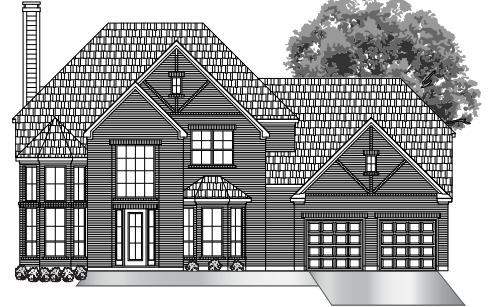
• ELEVATION A3 •