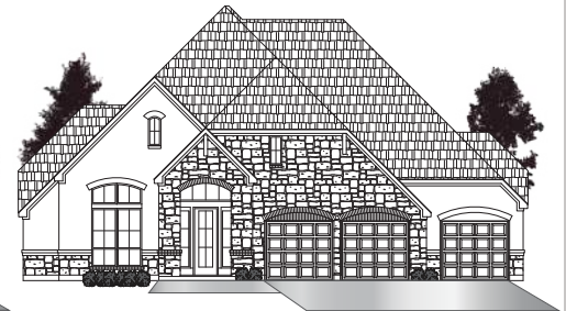
• ELEVATION D2 •