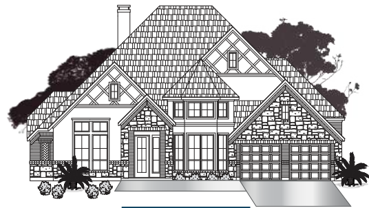
• ELEVATION E3 •