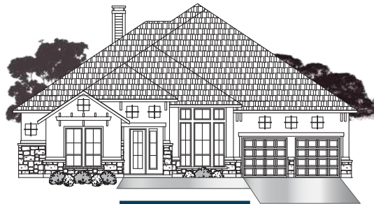
• ELEVATION D4 •