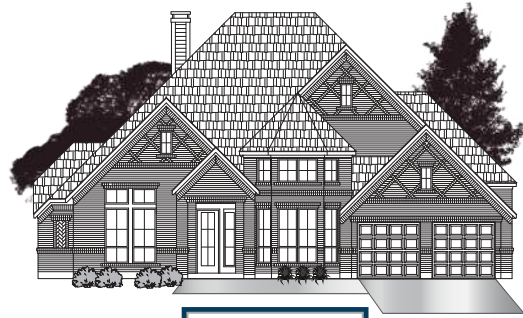
• ELEVATION C3 •