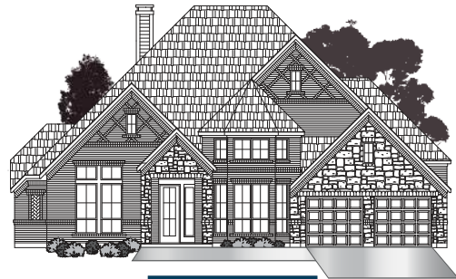
• ELEVATION D3 •