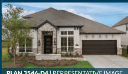
PLAN 3546-D4 | REPRESENTATIVE IMAGE

READY! 2-Story Home 5 Bedroom 4 1/2 Bathroom 3 1/2-Car Garage 3,799 Sq.Ft. Corner Homesite