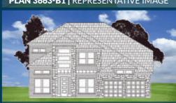
PLAN 3799-F2 | REPRESENTATIVE IMAGE

TBD 1 1/2-Story Home 4 Bedroom 3 1/2 Bathroom 3-Car Garage 3,802 Sq.Ft. Game Room Theater Room Covered Patio