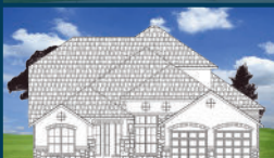
PLAN 3546-D4 | REPRESENTATIVE IMAGE

TBD 1 1/2-Story Home 4 Bedroom 3 1/2 + 1/2 Bathroom 3-Car Garage 3,680 Sq.Ft. Game Room Theater Room Covered Patio