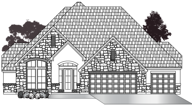
• ELEVATION D1 •