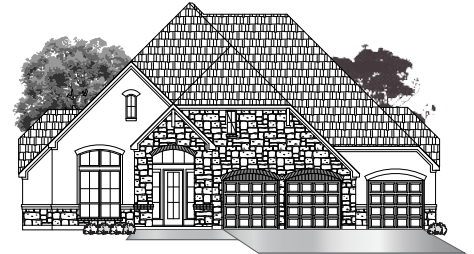
• ELEVATION D2 •