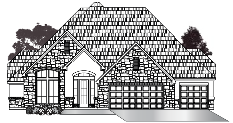
• ELEVATION D1 •