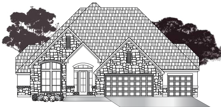
• ELEVATION D1 •