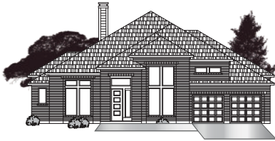
• ELEVATION F1 •