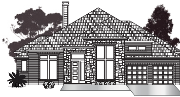
• ELEVATION F2 •