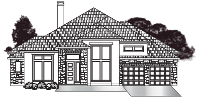
• ELEVATION F3 •