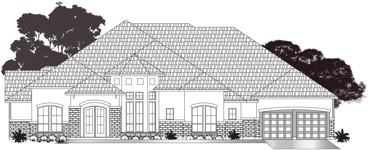
• ELEVATION D4 •