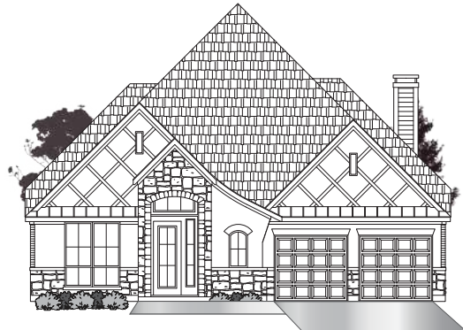
• ELEVATION D3 •