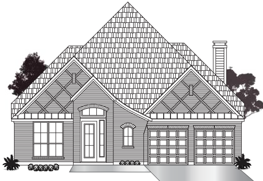
• ELEVATION C3 •