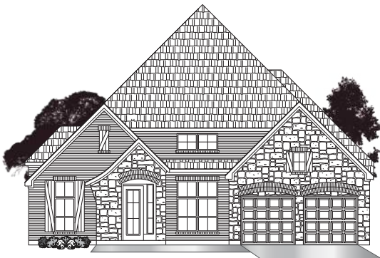
• ELEVATION C1 •