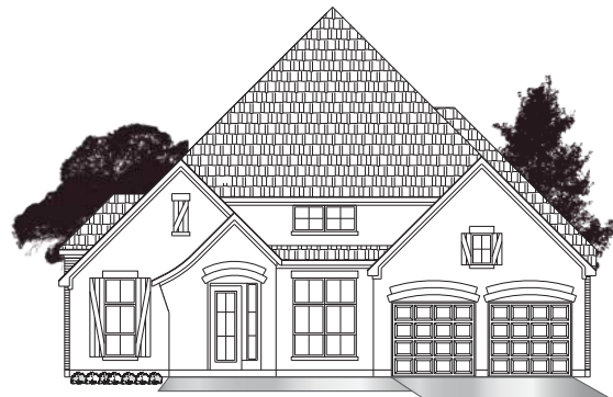
• ELEVATION D1 •