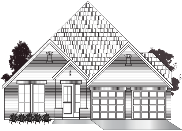
• ELEVATION A1 •