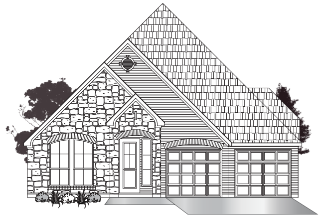
• ELEVATION B2 •