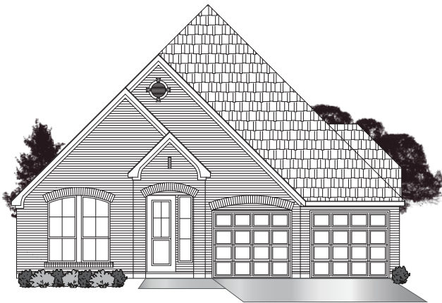
• ELEVATION A2 •