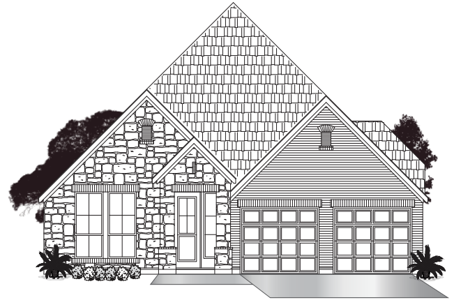
• ELEVATION B1 •