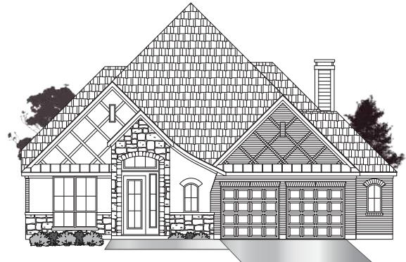
• ELEVATION D3 •