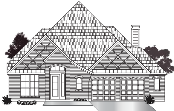
• ELEVATION C3 •