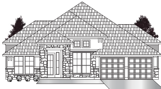
• ELEVATION D3 •