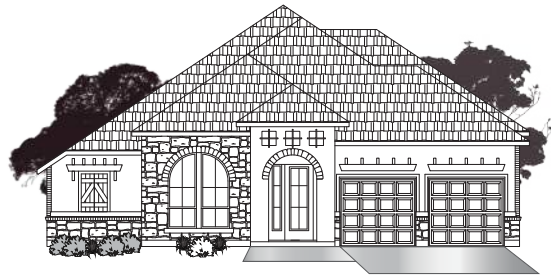
· ELEVATION D3 ·