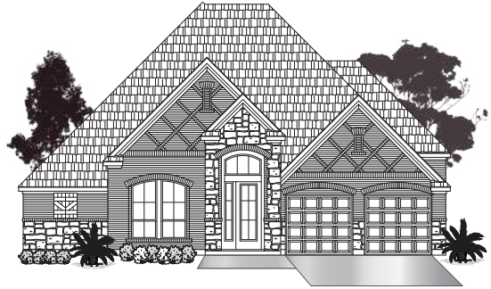
· ELEVATION B1 ·