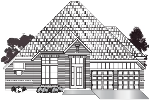
· ELEVATION A2 ·