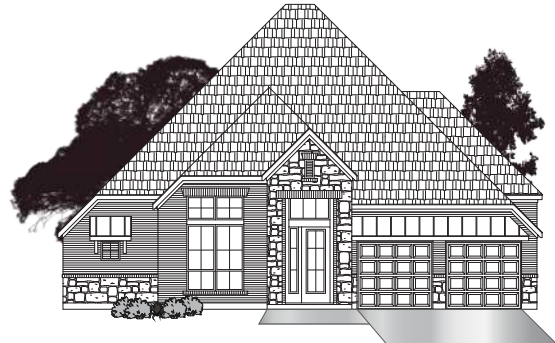
· ELEVATION B2 ·