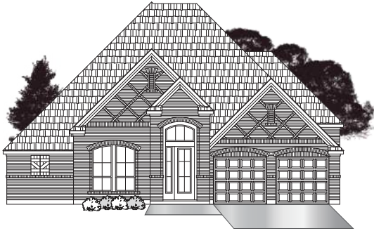
· ELEVATION A1 ·