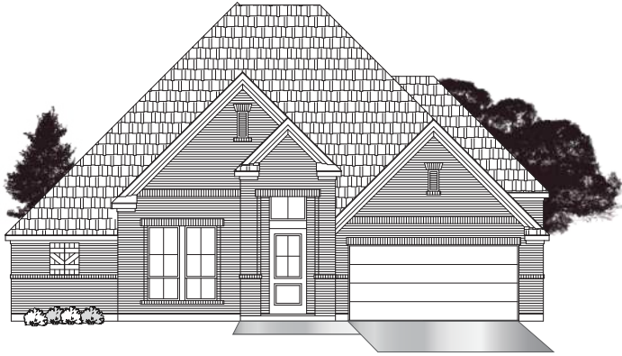
· ELEVATION A1 ·