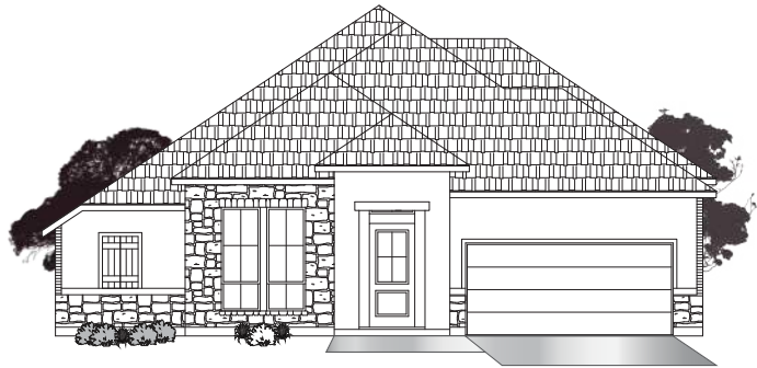
· ELEVATION D3 ·