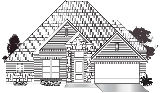
· ELEVATION B1 ·