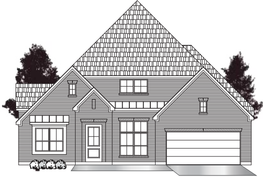
• ELEVATION A1 •