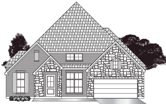
• ELEVATION C1 •