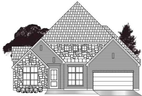
• ELEVATION B2 •