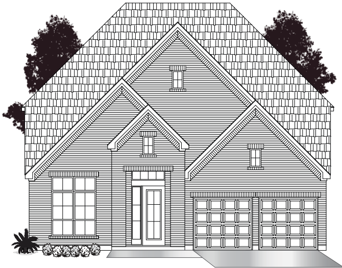
· ELEVATION A1 ·