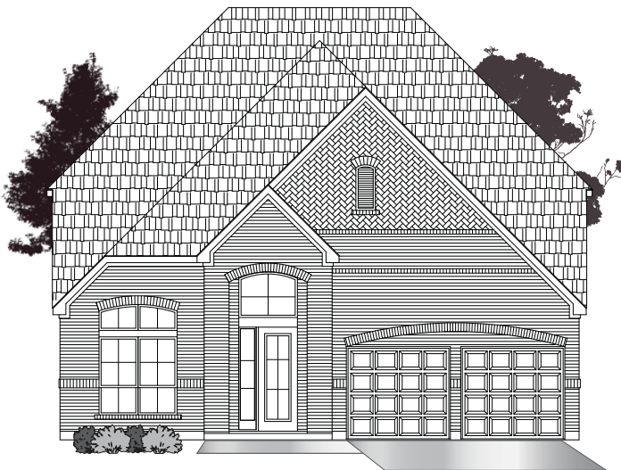
· ELEVATION A2 ·