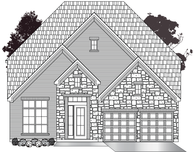
· ELEVATION B1 ·