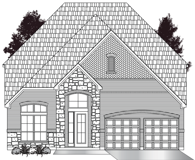
· ELEVATION B2 ·