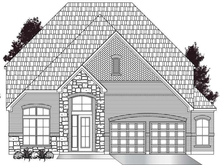
· ELEVATION B2 ·