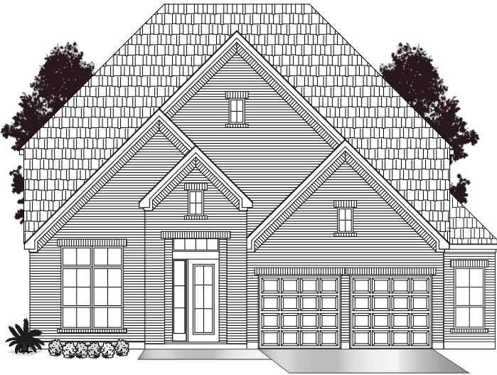
· ELEVATION A1 ·