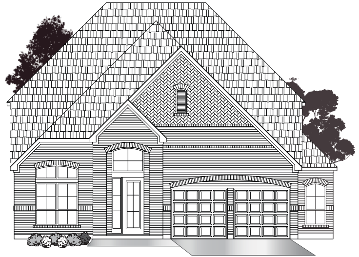
· ELEVATION A2 ·