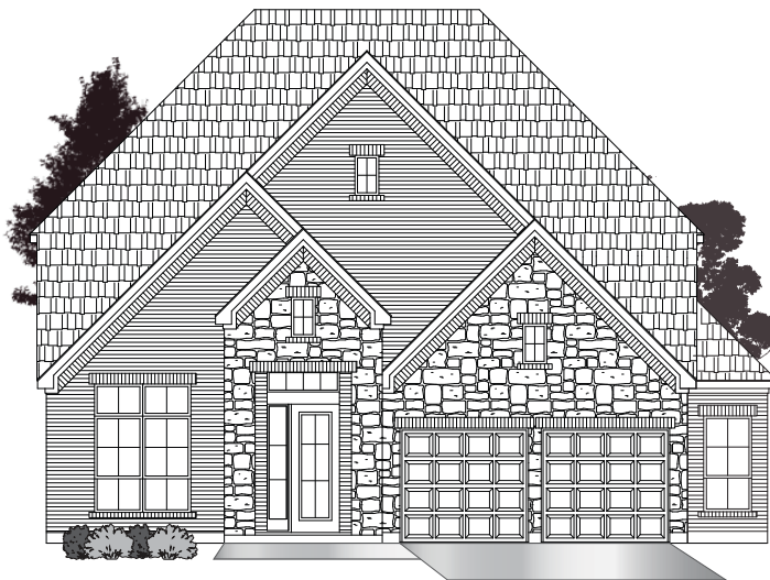
· ELEVATION B1 ·