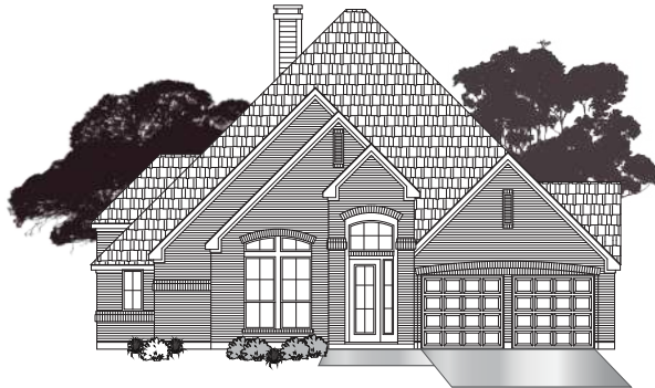
• ELEVATION A2 •