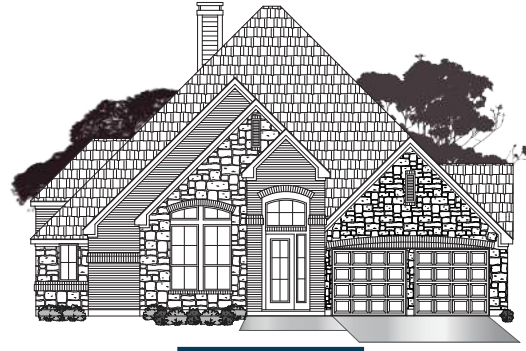
• ELEVATION B2 •