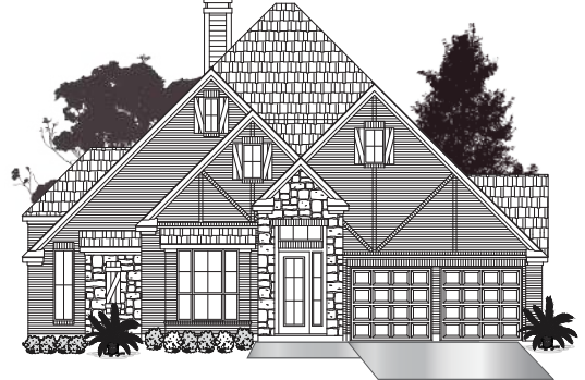
• ELEVATION B1 •