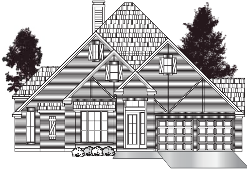
• ELEVATION A1 •