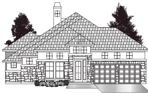
• ELEVATION D3 •