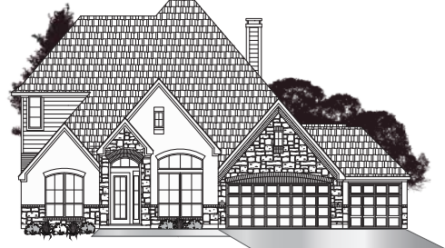
• ELEVATION D3 •