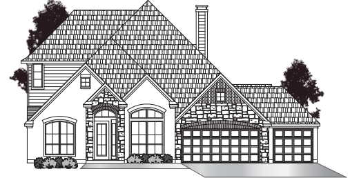
• ELEVATION D2 •