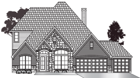
• ELEVATION C3 •