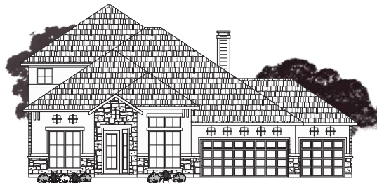
• ELEVATION D4 •