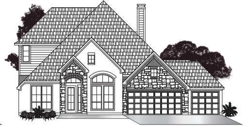
• ELEVATION D1 •