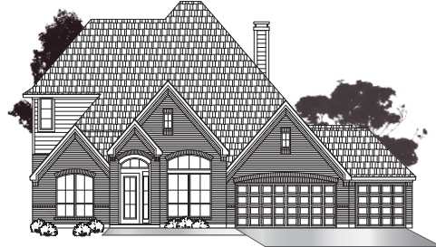
• ELEVATION AC3 •