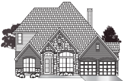
• ELEVATION C3 •