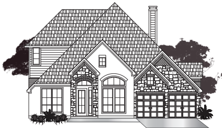
• ELEVATION D1 •