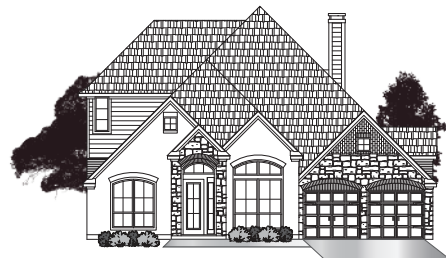
• ELEVATION D2 •