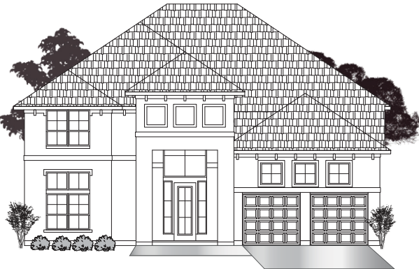
• ELEVATION D3 •