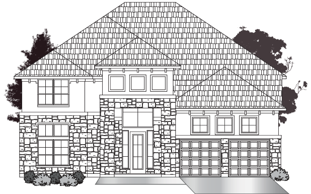
• ELEVATION E3 •