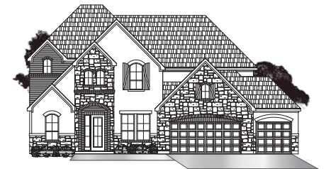
• ELEVATION D2 •