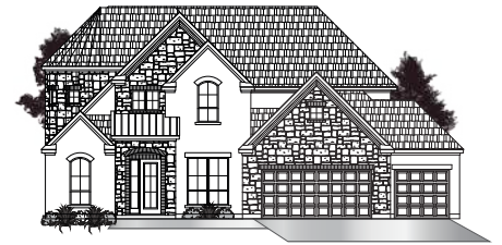
• ELEVATION D1 •