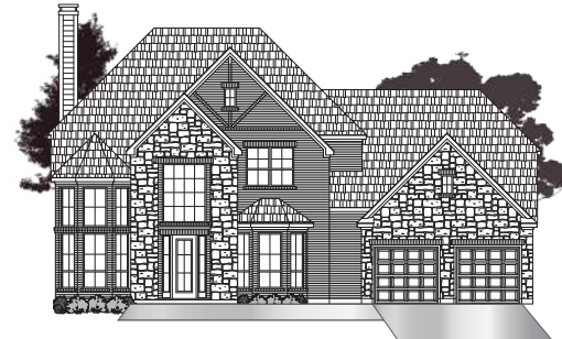
• ELEVATION B3 •