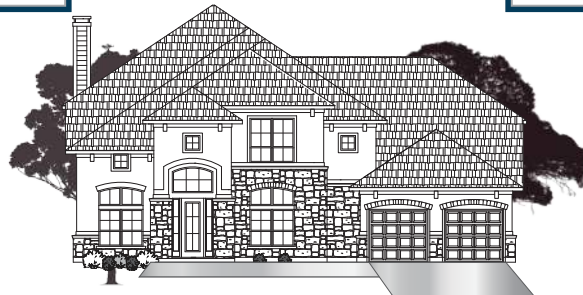
• ELEVATION D3 •