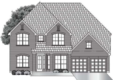
• ELEVATION A3 •