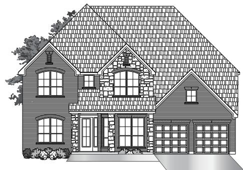
• ELEVATION B3 •