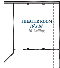
THEATER ROOM PACKAGE