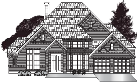
· ELEVATION C3 ·