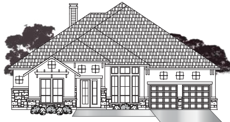
· ELEVATION D4 ·