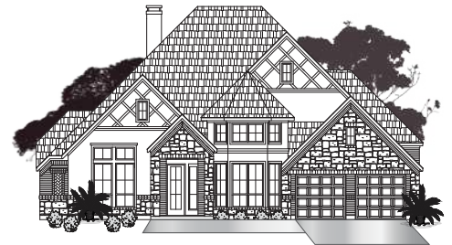
• ELEVATION E3 •