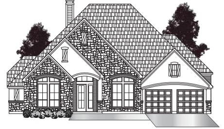
• ELEVATION D1 •