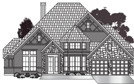
• ELEVATION D3 •