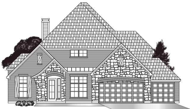
• ELEVATION C1 •