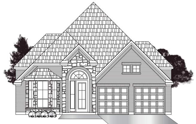
• ELEVATION B3 •