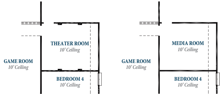
OPTIONAL THEATER ROOM Adds additional 181 square feet