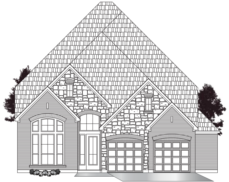
• ELEVATION B1 •