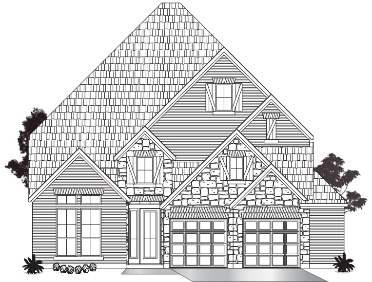
• ELEVATION B2 •