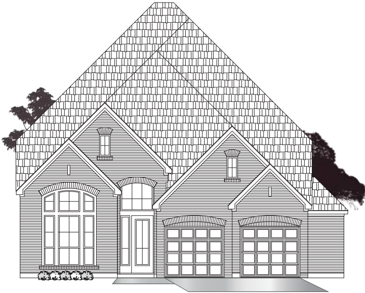
• ELEVATION A1 •