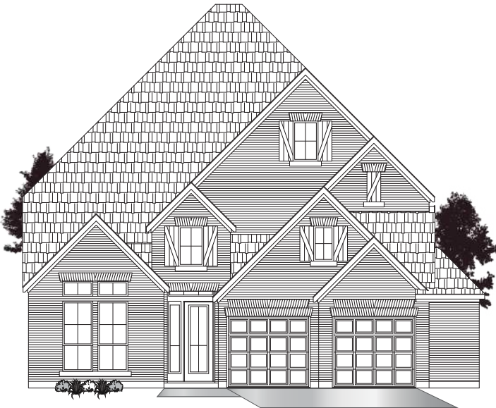
• ELEVATION A2 •